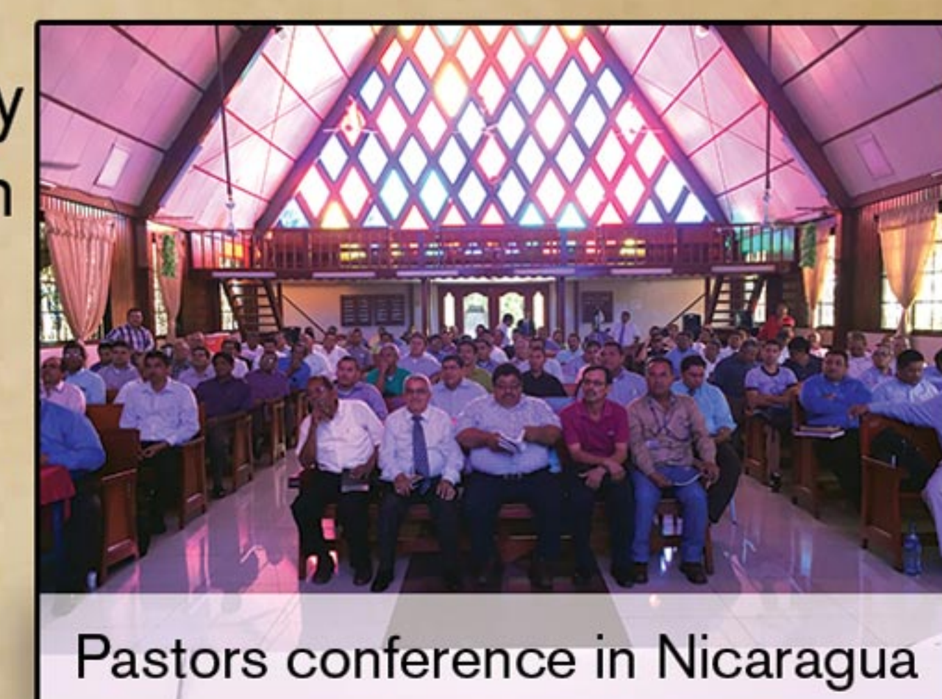
Pastors conference in Nicaragua

The trip to Nicaragua was, by God's grace, quite fruitful. I preached at a pastors conference in Managua. They requested me to present my seminar, Clouds Without Water . The prosperity gospel has made huge inroads in recent years to the evangelical churches there. In fact, numerous pastors (there were about 250 in attendance) came up to me and told me that not only have their church members been influenced, but even some of them have been as well, particularly in the widely-held but erroneous belief that God still speaks today outside of scripture. They were genuinely grateful to have their misunderstandings corrected. Some thanked me through tears. What a joy it is to see God's people come into a better understanding of His word.