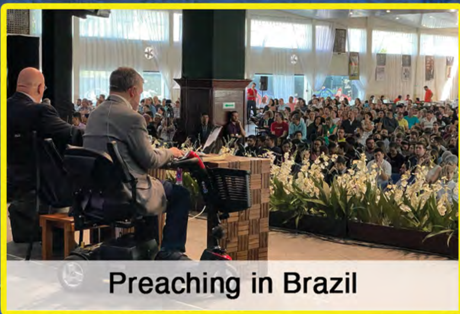
Preaching in Brazil