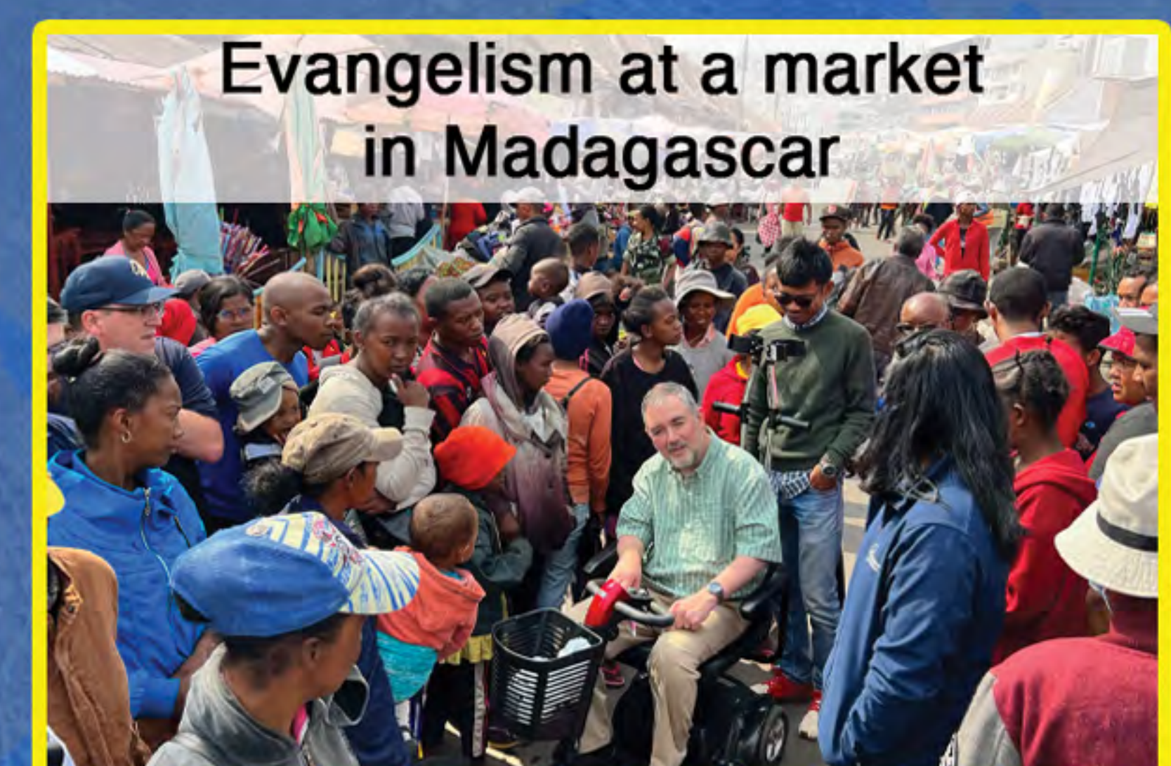
Evangelism at a market in Madagascar

We are living in dark times, dear ones. In the United States, we are being governed by a wicked administration that champions all the sins listed in Romans 1. Persecution is a reality for many of our brothers and sisters in other parts of the world, but it is coming to western nations too. The storm clouds are rising. My friends and I used to joke about how one day we might have to do prison ministry because we’ll be arrested for our faith. What seemed mostly like a joke five or six years ago now appears all too real. The way things are going — and if it pleases the Lord to allow me to live another couple of decades — I would not be surprised if my final days are spent in prison. Yours may be as well. The day will come when it will be illegal to preach against homosexuality or transgenderism, or even simply that Jesus is the only way to be saved. But take comfort in the complete sovereignty of our great God and Savior Jesus Christ. Take comfort in knowing that as the times get darker, the brighter the Gospel’s Light will shine.