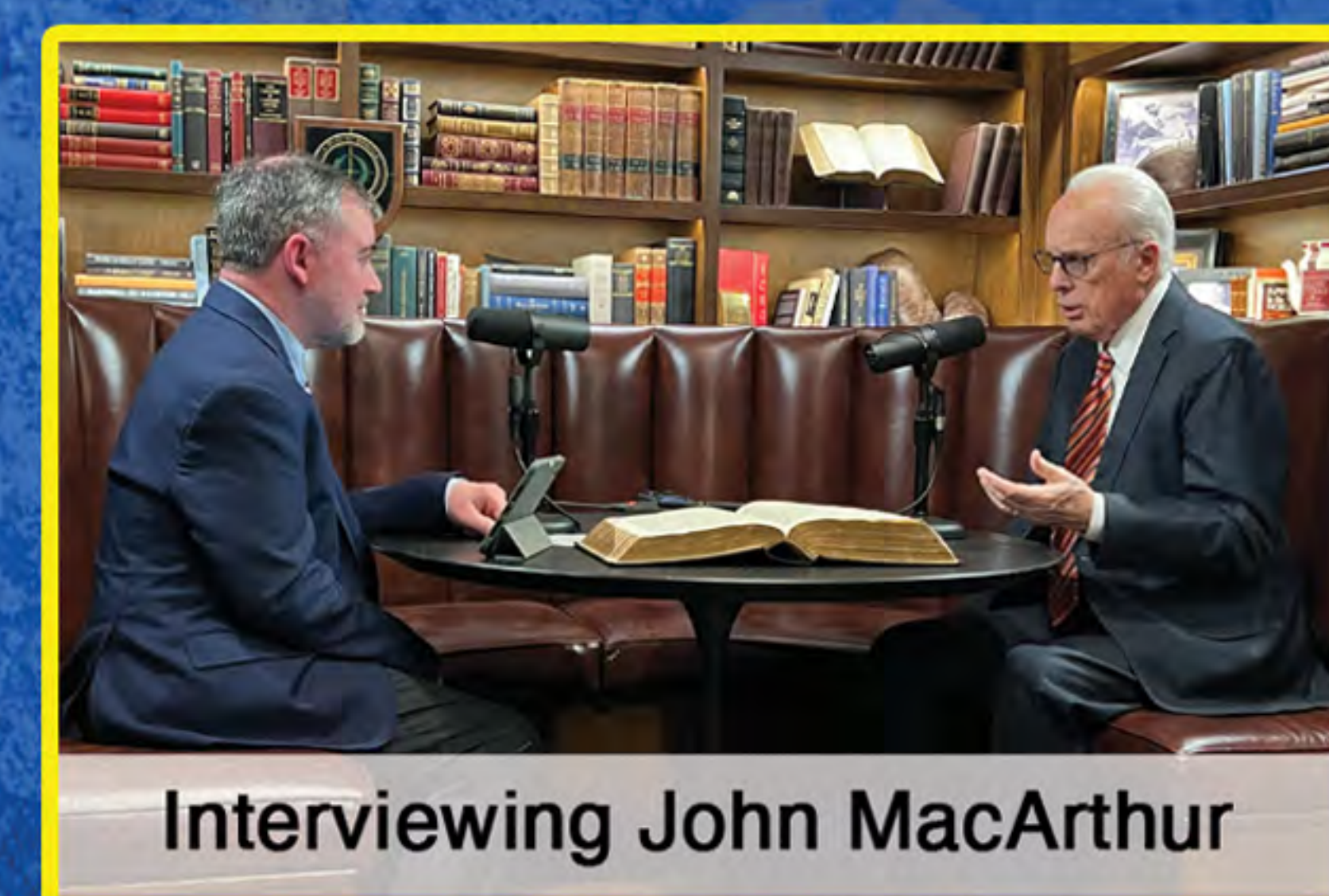
Interviewing John MacArthur

Another YouTube highlight for me came in March when I had the privilege of interviewing John MacArthur. I wrote John a letter back in 2021 asking him if he would be willing to do an interview with me. He graciously accepted. The interview was conducted in March 2022 at the MacArthur Center for Expository Preaching on the campus of Grace Community Church. John has done so many interviews, so it was a challenge to think of questions that he may not have been asked before. I really wanted the interview to be of help to pastors and elders of smaller churches who faithfully labor in anonymity. These men do not have the big platforms and are not being asked to speak in the big conferences, but they are every bit as faithful and every bit as dedicated to rightly dividing God’s Word. Pastors of smaller churches often do not have other like-minded pastors in their area that they can fellowship with or seek advice from. John MacArthur has been through many battles and has acquired much wisdom in his now 53+ years of pastoring Grace Community Church, and I wanted this interview to be an encouragement to them.