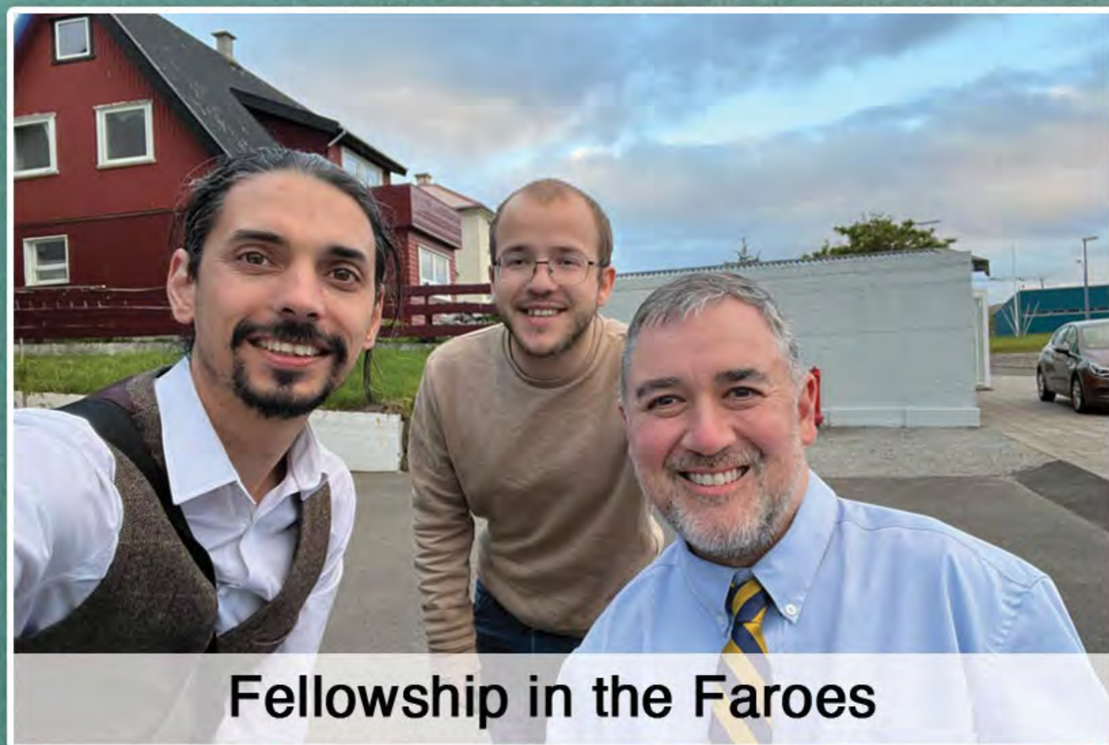
Fellowship in the Faroes

On a more serious note, what Hamas did on October 7, 2023, in Israel was the face of pure evil. The hatred that so many Muslims (not all, but many) have towards the Jewish people is other-worldly. It is a hatred that goes beyond a normal human hatred—it is demonic. It is a demonic hatred for God’s chosen people, the Jews. I am not saying that Israel is a perfect nation; there are no perfect people and so there are no perfect nations. But God does have a plan for Israel, and we as Christians must and should support her. In this support, however, we should be mindful that apart from being born again, the Jew will enter the same Hell as the Muslim. I’ve seen some in evangelical circles speak of Jews in ways that suggest they need not come to Christ. This is serious error. Anyone who has not repented of his sin and placed his faith in Christ is an evangelistic prospect, Jew and Gentile alike.