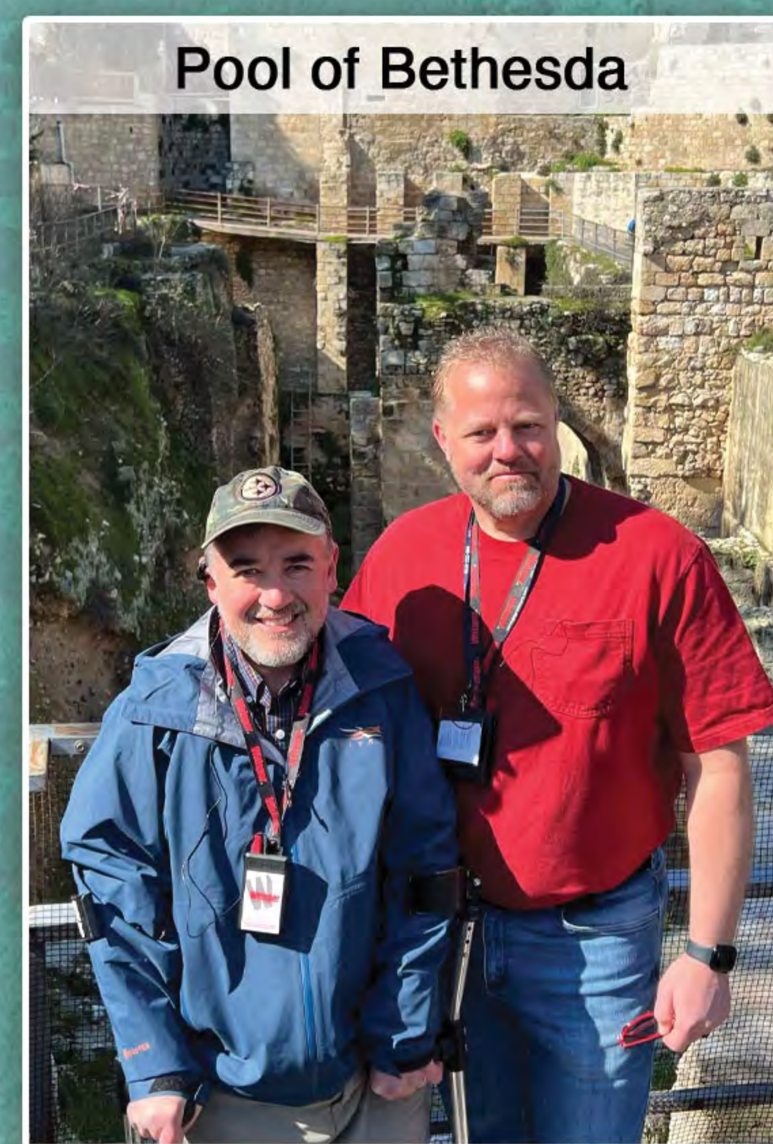
Pool of Bethesda

Well, there is to this day some water at the bottom of the Pool of Bethesda. As Jim and I were approaching it (he walking and me in my electric scooter), he looked at me and said, “If I see so much as the slightest ripple in that water, I’m picking you up over my shoulder and throwing you in there!” The whole group got a good laugh out of that one!